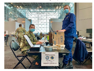
COVID-19 Interagency Response - Javits Center 2020

From January 2013 to July 2022, the number of Public Health Service officers deployed has increased more than twofold.