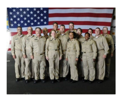
Officers supporting Continuing Promise Humanitarian Mission in 2008