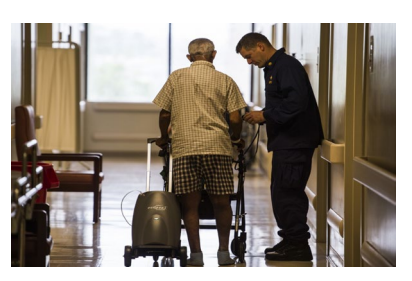
Commissioned Corps Officers at Indian Health Service

A component of the Department of Health and Human Services, and assigned to 27 Agencies and 9 Departments, we: